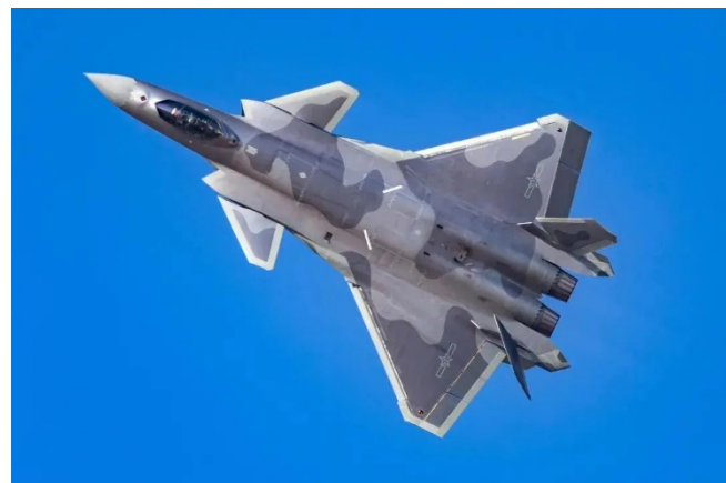
The J-20 stealth fighter.

On 9 December the Dutch Aviation Society's website Scramble reported that a J-20 bearing the serial number 61162 had been spotted the day before. 1 The J-20 is the first and only fifth-generation 2 fighter that the Chinese People's Liberation Army (PLA) Air Force operates. Judging from this serial number, the aircraft would belong to the 5 th Aviation Brigade. 3 The brigade would, therefore, be the third combat brigade of the PLA Air Force (PLAAF) to have received stealth fighters. 4 Unfortunately, the report did not include an image of the aircraft or any other information that would enable one to determine the validity of the report.