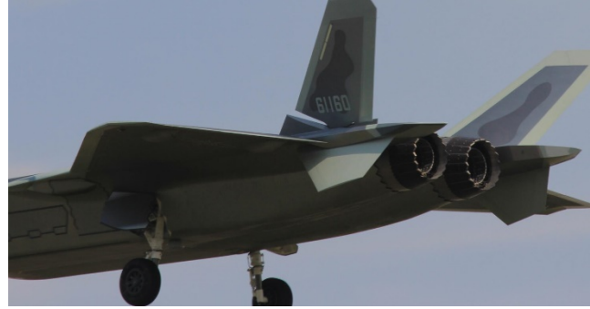
The photograph of the J-20 61160 that was posted by “observer”

has not completely replaced its fleet of J-11B fighters. In fact, the brigade operated the J-11B, a variant of the fourth-generation Su-27, throughout 2021 and continues to operate it today. 15 Therefore, even if the 1 st Aviation Brigade has more than one PLAAF flight group operating the J-20, it is unlikely to have more than two, resulting in a maximum total of 16 to 20 J-20s.